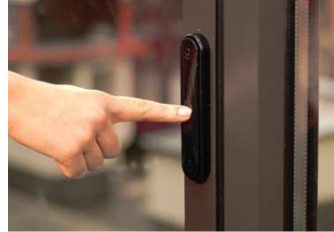
Unique, flush line pop-out handle that allows maximum door opening

Rhino manufacture high performance bi-folding doors which exceed the October 2010 building regulations. Our doors benefit from Low-E, Argon gas filled sealed units with a 1.2 centre pane value, with toughened safety glass as standard. They are weather tested to the highest standards, with a wind resistance of 2400 Pa and U-Values of only 1.7 W/M 2 K, with even lower U- Values possible using our Planitherm 4S glass.